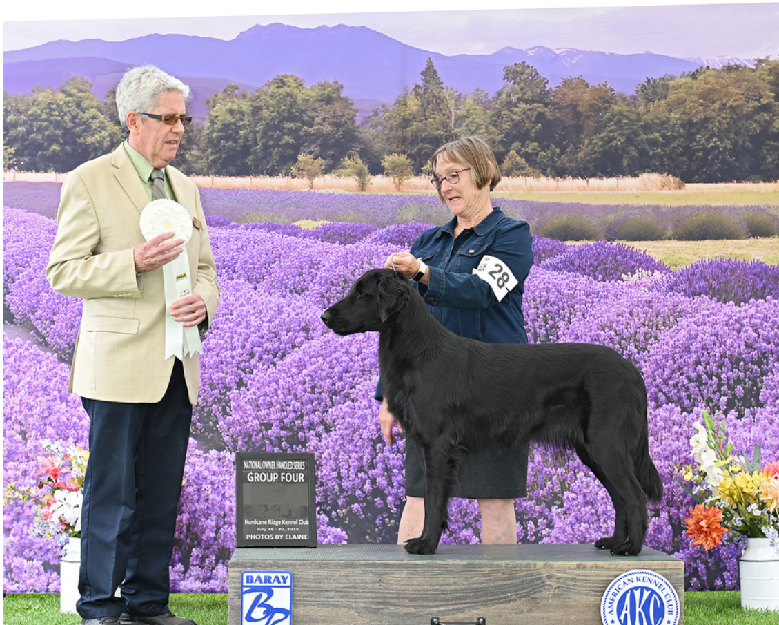
GCH Rainshadow We Shall Overcome BN JH WCX (Glory) and her Owner Handled group placement at the Hurricane Ridge Show in July.