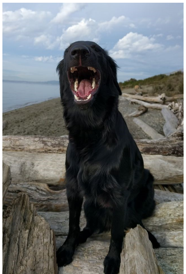
Lola Kirkness-Rotter enjoys a good joke. Victory's Ready for the Spotlight.