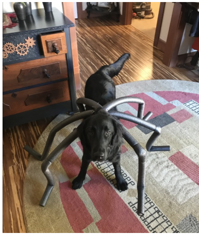
Glory Beevers, who at nine months seems to have grown antlers! "Solstice Finding the Glory"