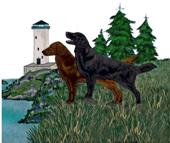
Northwest Flat-Coated Retriever Club