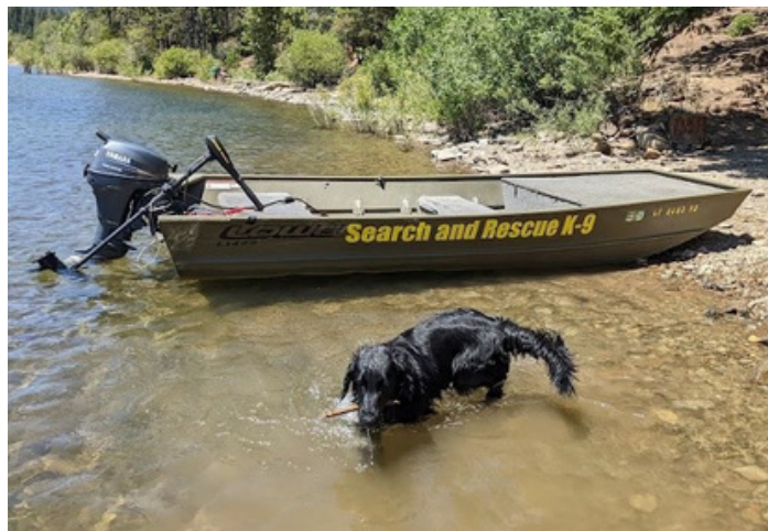
Kashi cools off in Lake Siskiyou after a certification test.