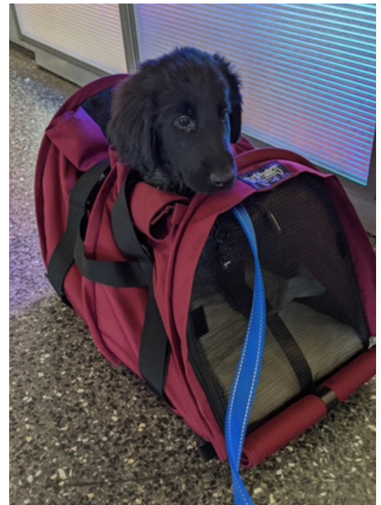
The stork brings Salem's son from the east coast.