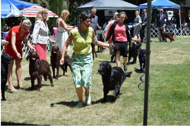
All Hands on Deck! Northwest Club Members pitched in to show stud dogs and their “get”.