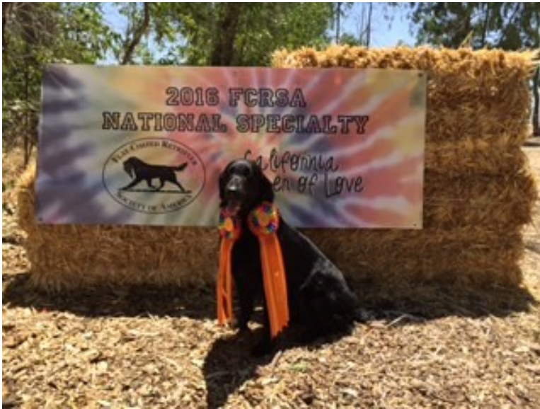
Two senior hunt test passes! GCH Rainshadow's Rollin' on the River CD TD RA BN JH WCX "Flo" proudly wears her ribbons !