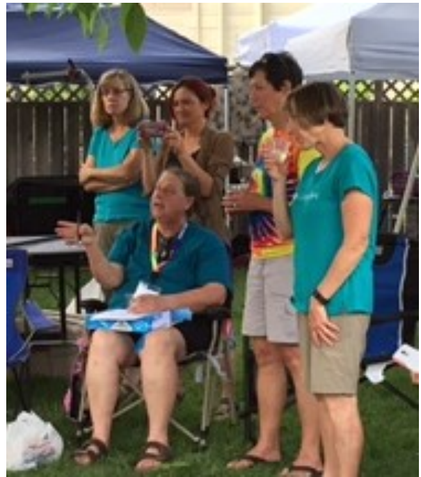
"I will if you will." NWFCRC members hold a serious discussion about hosting the 2019 specialty.