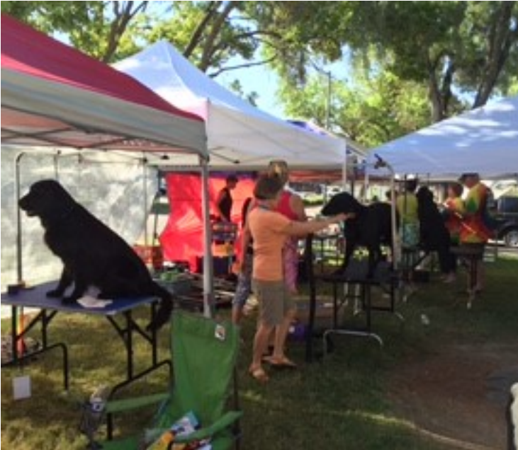
What? Another bitch in season? The poor boys.