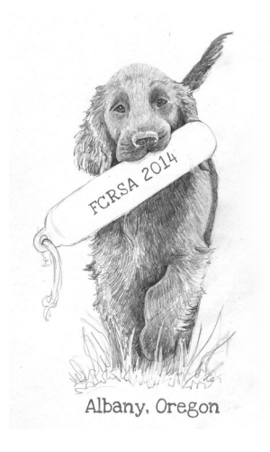
I'll be there; will you? I hope you are coming, because I want to meet EVERYBODY!

There are two basic courses: a "Standard" course which includes jumps, tunnels, weave poles, A-Frame, dogwalk, pause table, chute, and a tire-jump, and a "Jumpers With Weaves" course which includes jumps, weaves, and perhaps a tunnel. The Novice courses are for beginners. Dogs who have earned their novice title run in Open, and more advanced dogs run in Excellent. While all flat-coats are entertaining and fun to watch, the prestigious MACH dogs are outstanding. We'll also be running a "Time to Beat" course, which is a "hybrid" course. Each dog has the chance to set the "Time to Beat" for his jump height.