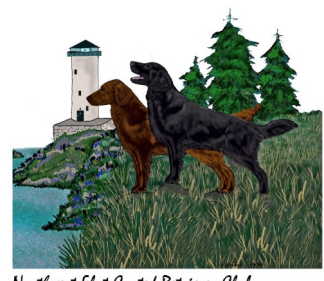
Northwest Flat-Coated Retriever Club

Editor's Note: Due to the overwhelming information about the Specialty, some of our regular features (Health Matters, Meet our Members) were omitted from this edition. I apologize for the lack of "meaty" articles and plan to include them in future editions. Right now, all energy and attention must be focused on the enormous task of putting on the Specialty.