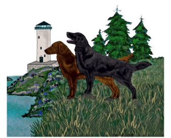
Northwest Flat-Coated Retriever Club