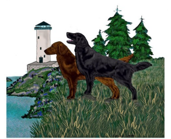
Northwest Flat-Coated Retriever Club