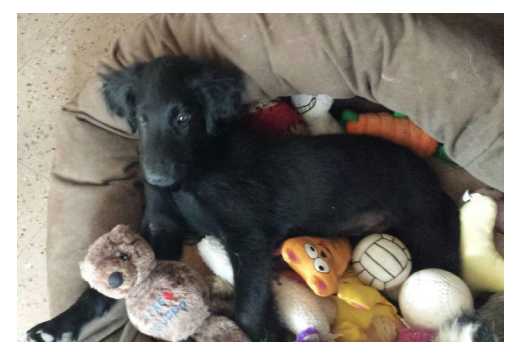
I'm so lucky! Look at all my toys!