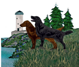
Northwest Flat-Coated Retrievers Club

Flat –Coat Times Jo Chinn, Editor 331 Livengood Lane Sequim, WA 98382